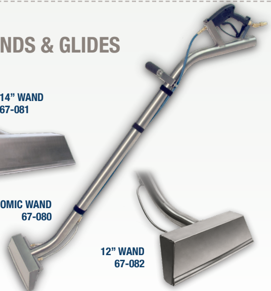
12" WAND 67-082