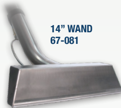
14" WAND 67-081