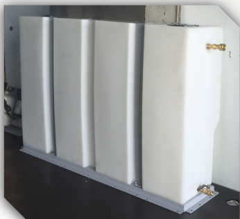
SADDLE TANK, SINGLE W/PUMP 68-390